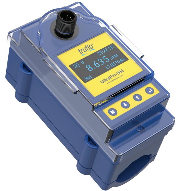
UltraFlo® UF-500 Clamp-On Ultrasonic Flow Meter